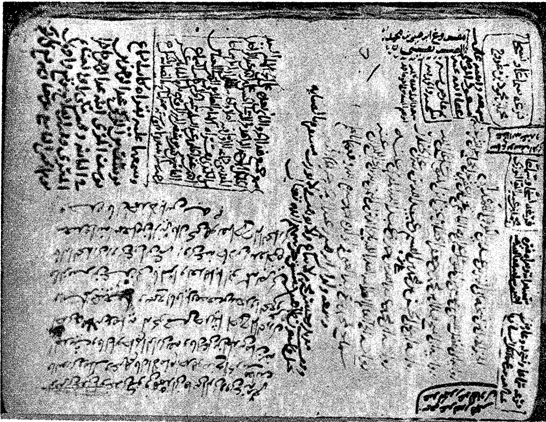
A part of the unauthentic Mushkhaf of al-Zubair b. 'Adi.